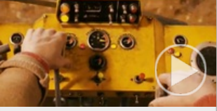
Do you hate Wes Anderson? Maybe this is why