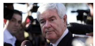
Experts say Gingrich moon base dreams not lunacy