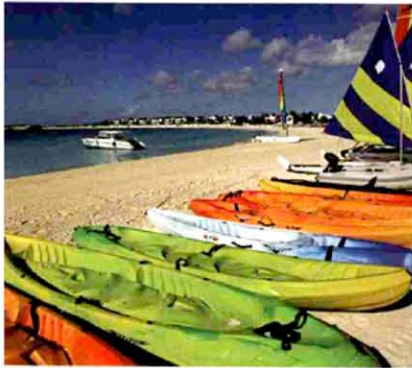
Clockwise from top left: The Moorish architecture is striking. Enjoy breakfast on a private patio. Kayaking and other activities are available to guests.