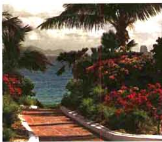
Clockwise from top: The pool area is perfect for a midnight rendezvous. Spice, one of the resort's restaurants, overlooks the sea. Bougainvillea lines the walkway from a villa to the beach. A romantic bath en suite.

The resort houses 98 spacious suites and rooms within its 18 villas. Now in its twenty-first season, Cap Juluca just underwent a rejuvenating multi-million-dollar facelift, led by noted designer Paul Duesing, who counts among his credits three Four Seasons properties, the Grand-Hôtel du Cap-Ferrat in Saint-Jean-Cap-Ferrat, and the London residence of the Sultan of Brunei.